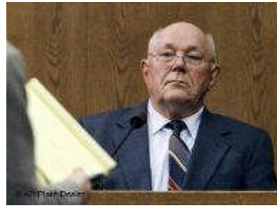
Demjanjuk's family insists he is innocent

Ukrainian-born Demjanjuk, deported from the United States in May, is number three on the Simon Wiesenthal Center's list of most wanted war criminals, behind two others believed to be dead.