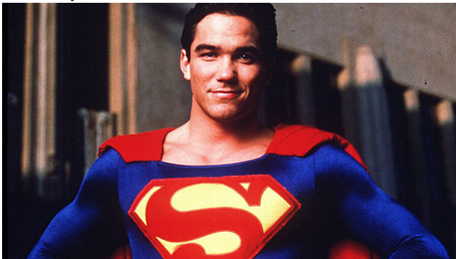
Actor Dean Cain in TV show Lois and Clark : The New Adventures of Superman

THE world's most famous champion of truth, justice and the American way says he intends to renounce his US citizenship.