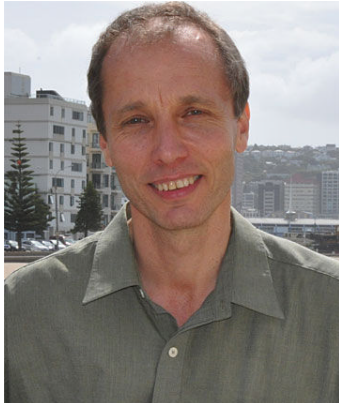
NICKY HAGER: Wants answers

It emerged yesterday that the Security Intelligence Service ordered a review of the national police computer system amid fears that Israeli agents had gained access to it after the Christchurch quake by loading sophisticated malware to obtain highly sensitive intelligence files.