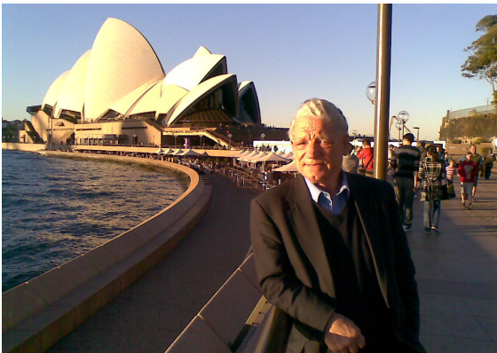
Dears at QODSNA – Salam

From: Fredrick Töben – 14 July 2011 - currently in Sydney, Australia.