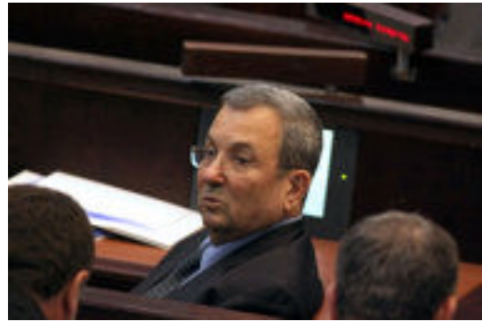
The "time has come" to deal with Iran, Israeli Defense Minister Ehud Barak, pictured

The "time has come" to deal with Iran, Israeli Defense Minister Ehud Barak said Sunday, refusing to rule out military action to curb the Islamic republic's nuclear ambitions.