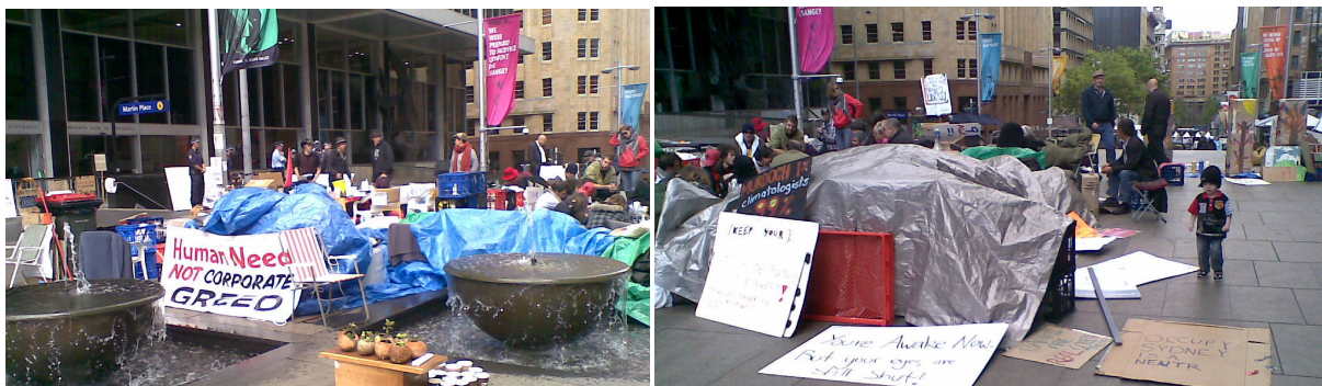
Peter checking out the "Occupy Sydney" site ...