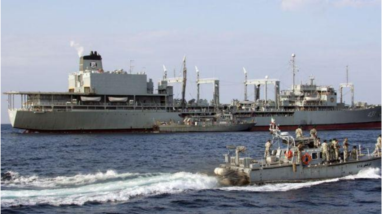
This file photo shows Iran's Kharg helicopter carrier.

Mon Jan 21, 2013 8:17AM GMT The 24th fleet of Iran's Navy has left a port in the south of the country for international waters to provide maritime security in the region.