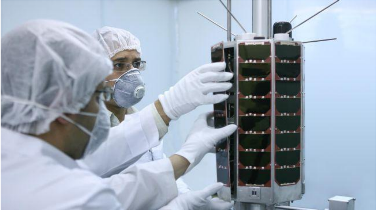
This file photo shows Iranian scientists working on an indigenous satellite.

Tue Jan 22, 2013 11:2AM GMT Iran will acquire the know-how to design and produce space suits by the next eight years."