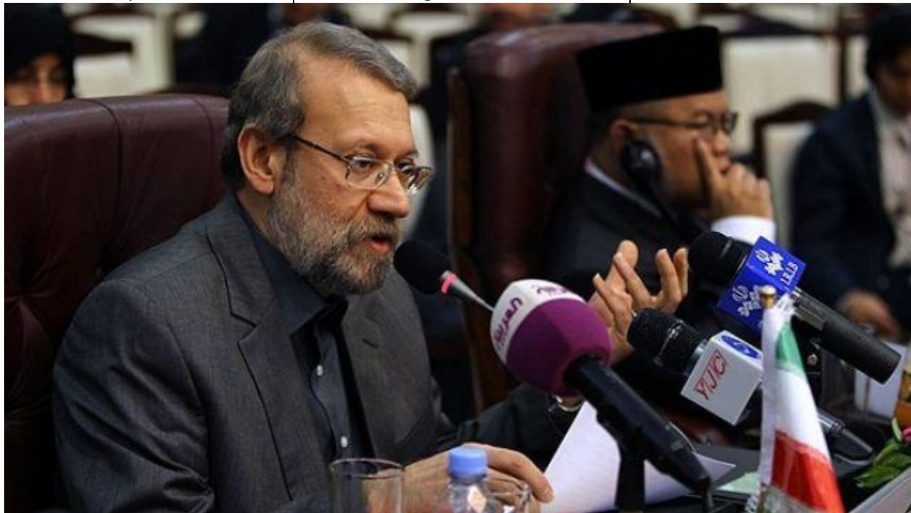
Iran Majlis Speaker Ali Larijani speaks at the 8th General Assembly Meeting of the Islamic Inter-Parliamentary Union in the Sudanese capital, Khartoum, on January 21, 2013.

http://www.presstv.ir/detail/285008.html