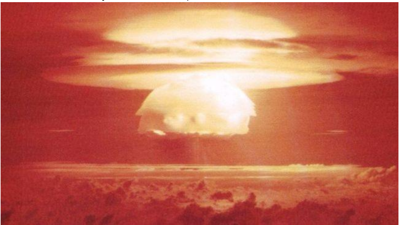
In the Castle Bravo nuclear test, the US military detonated a thermonuclear hydrogen bomb at Bikini Atoll, Marshall Islands on March 1, 1954.

Wed Jan 23, 2013 12:24AM GMT Officials in Indian-administered Kashmir have warned people to be prepared for the possibility of a nuclear war.