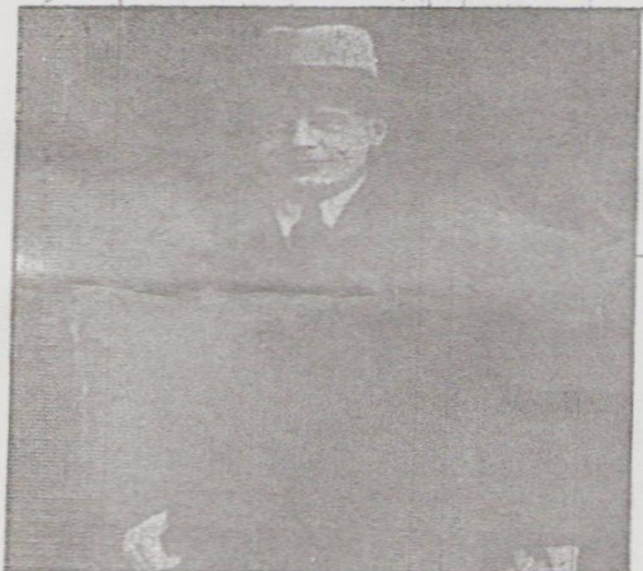
Ribbentrop: A sudden awakening