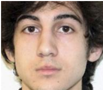
Boston bombings suspect Dzhokhar Tsarnaev