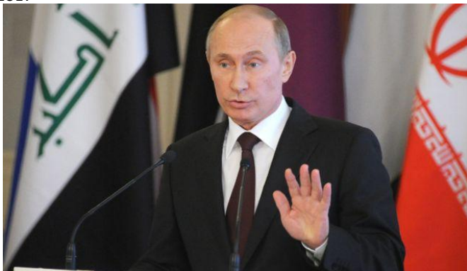
Russian President Vladimir Putin speaks in Moscow, July 1, 2013.