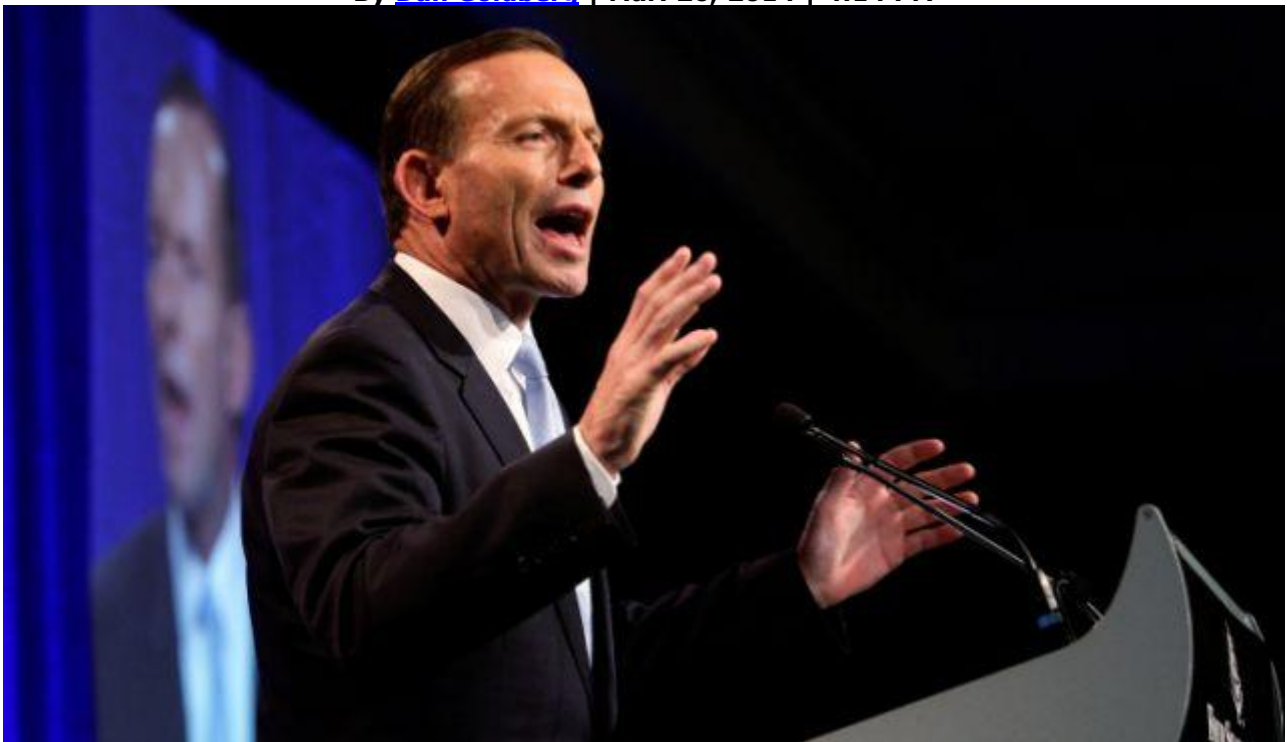
Australian opposition leader Tony Abbott speaks to supporters in Sydney, Saturday, Sept. 7, 2013, following his win in Australia's national election.