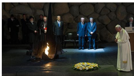
Pope Francis visits the Yad Vashem Holocaust Museum in Jerusalem 26 May 2014