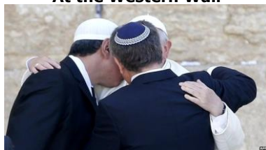
After praying at the Western Wall, Pope Francis embraced an imam and a rabbi.