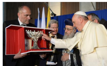
Pope Francis is presented with a Menorah on May 26, 2014 in Jerusalem.