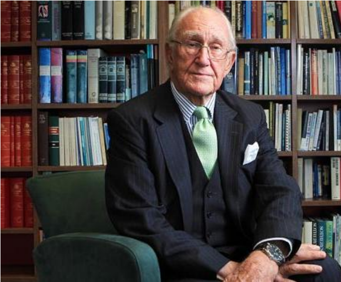
Australia's 22 Prime Minister, from 11 November 1975 to 11 March 1983