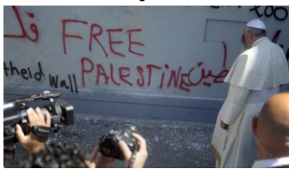
Pope Francis at the Separation Wall