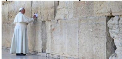
At the Western Wall