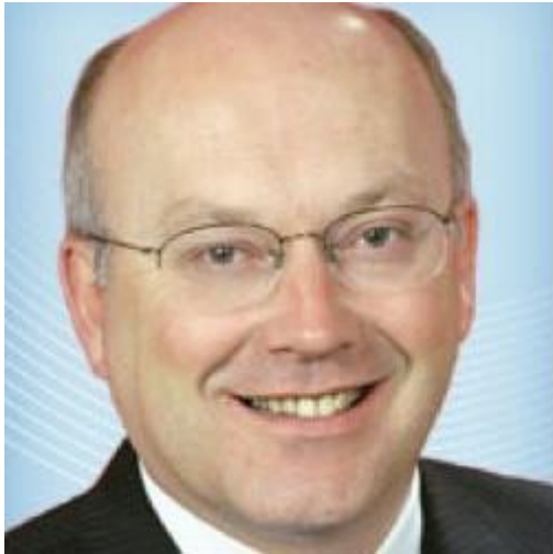
Attorney-General George Brandis.

ISRAELI Prime Minister Benjamin Netanyahu has lauded the Australian government after Attorney-General George Brandis (pictured) clarified last week the Coalition does not refer to East Jerusalem as "occupied".