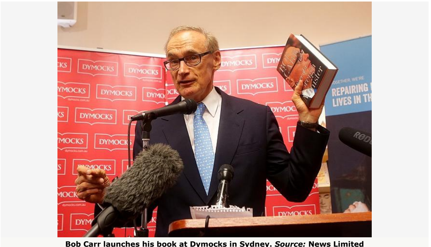
Bob Carr launches his book at Dymocks in Sydney.