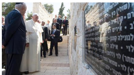
Pope Francis visits the Theodor Herzl memorial – founding father of the Zionist movement.