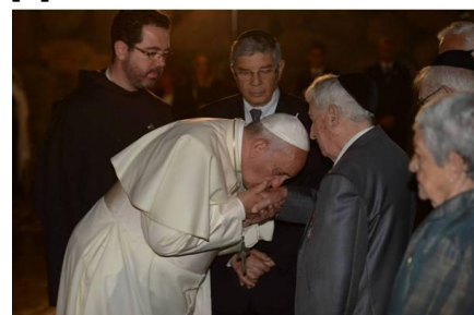
Meeting Holocaust survivors.