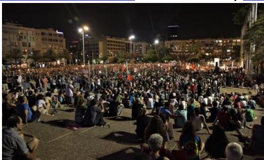
An estimated 10,000 people attend a rally for peace in Tel Aviv's Rabin Square.

Orlando Crowcroft in Jerusalem, The Guardian , Monday 18 August 2014 01.14 AEST