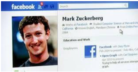
Screen shot of Mark Zuckerberg, creator of Facebook and young multi-billionaire who is in a mixed-race marriage.