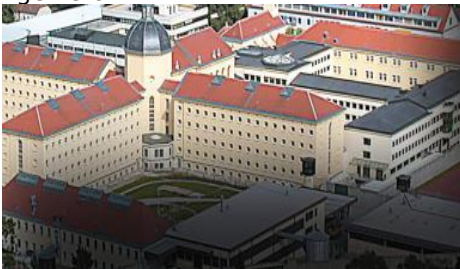
Die Justizanstalt Stein