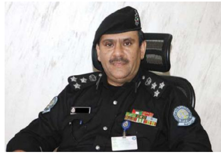
A senior official at the Interior Ministry's General Department of Criminal Evidence.