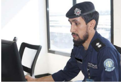
An official at work at the DNA identification lab in the General Department of Criminal Evidence.

DNA tests will be done through specimens taken from individuals to match their DNA in paternity cases or as suspects in criminal cases. Specimens are often taken from saliva or through a few drops of blood placed on special cards. Specimens are then tested in labs according to international scientific and technical methods using special DNA examination equipment.