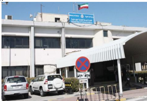
KUWAIT: The Interior Ministry's General Department of Criminal Evidence building, where the DNA identification lab is located.

In an effort to learn more about the latest updates with regards to the DNA tests that will be applied in Kuwait this year on citizens, expatriates and visitors, Kuwait Times conducted the following interview with senior officials in charge with implementing the project at the Interior Ministry's General Department of Criminal Evidence: