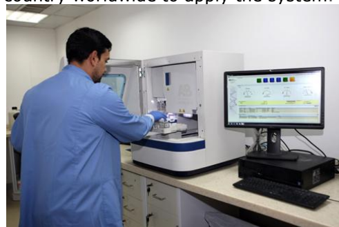
A worker examines a sample using high-tech equipment at the lab.

Passing law number 78/2015 places Kuwait at par with those countries. Kuwait will have a database including DNA fingerprints of all citizens, residents and visitors. This law is the first of its kind in the world and Kuwait is the first country worldwide to apply the system.